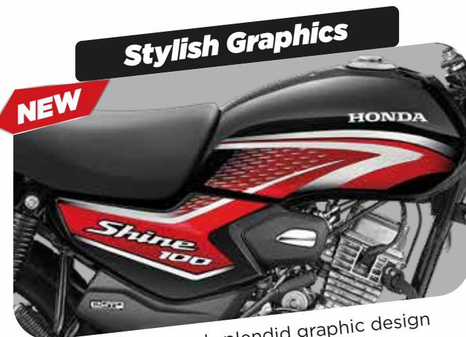
All new enriched and splendid graphic design that compliments the overall look of the bike.